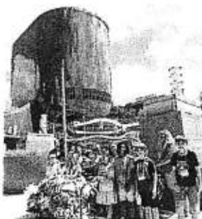
Right: Senior high service project at Camp Brethren Heights.

200 or so people were at the vigil sponsored by the Gun Violence Prevention Action Team.