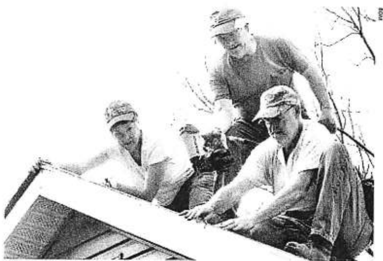
Brethren Disaster Ministries volunteers work in Kentucky.

Housing will resume at the Habitat for Humanity Pennyryle Region Warehouse. The goal will be to complete the homes that Brethren Disaster Ministries started work on but could not complete by the middle of August, when the full project closed.